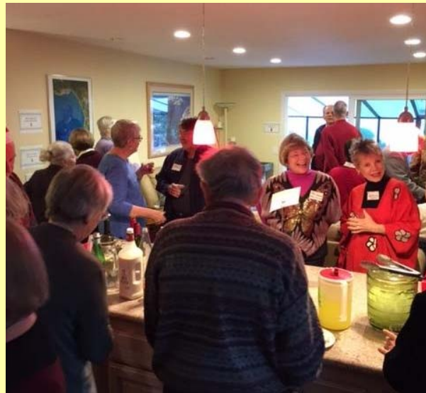
December Holiday Party - Thank you,